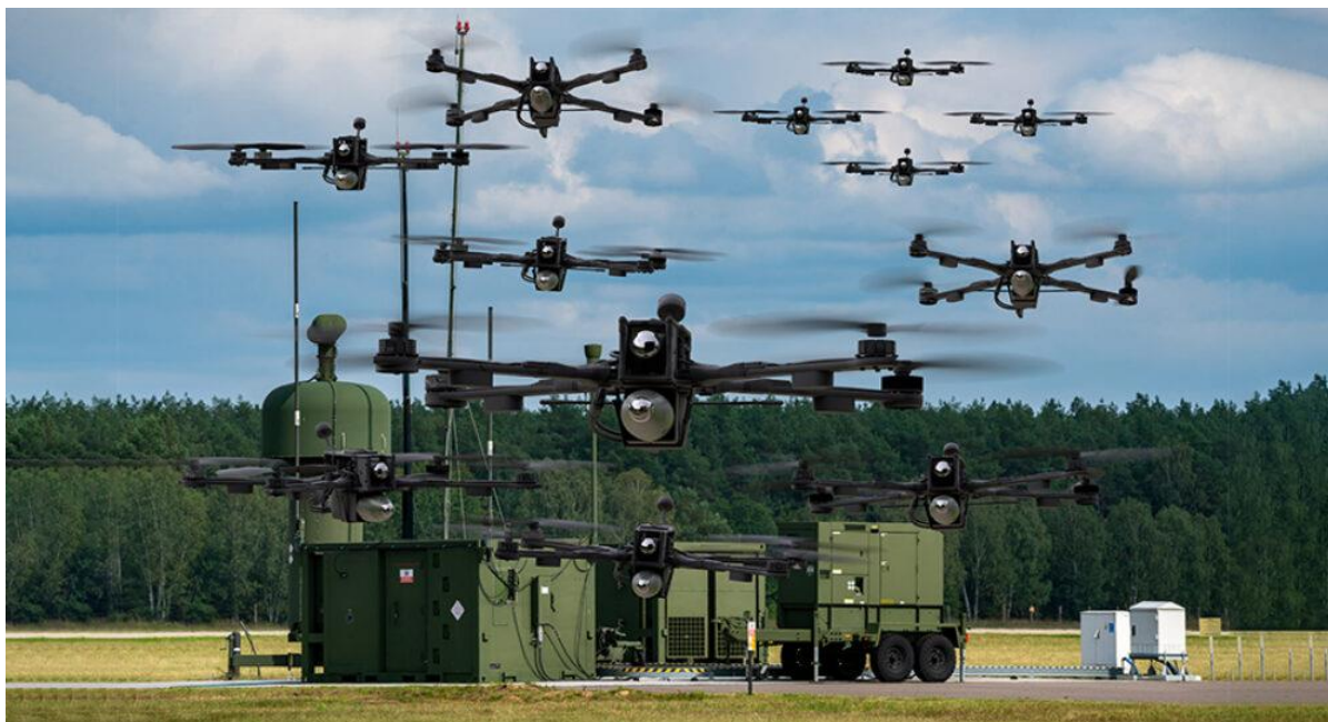
Figure 4. Swarm of combat drones and command systems-3d illustration

The use of unmanned aerial vehicles will remain a feature of future wars.