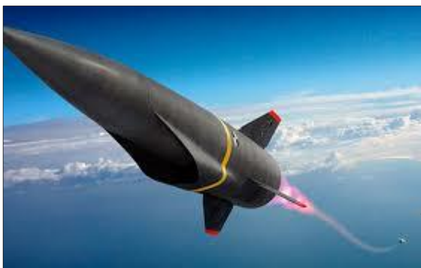
Figure 1. Hypersonic missile

The rapid pace of technological advancement in military and specialized equipment underscores the critical need to understand its implications for future conflicts. As nations continue to innovate in areas such as hypersonic weapons, artificial intelligence, and robotics, the nature of warfare is evolving beyond traditional strategies, requiring a shift in military doctrine and operational planning (Figure 1).