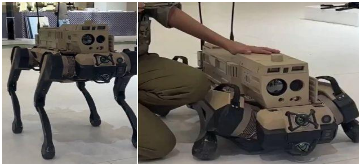
Figure 3. China's military "Robot wolf"

According to American specialists, the use of CRCs significantly increases the efficiency of intelligence and information tasks, fire-fighting, electronic countermeasures and other tasks, which, in turn, increases the effectiveness of the use of groups of troops (forces) operating in the theatre of operations.